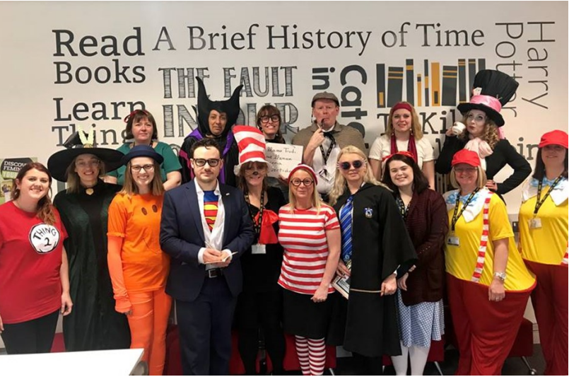
Teachers dress up as Book Characters for World Book Day.